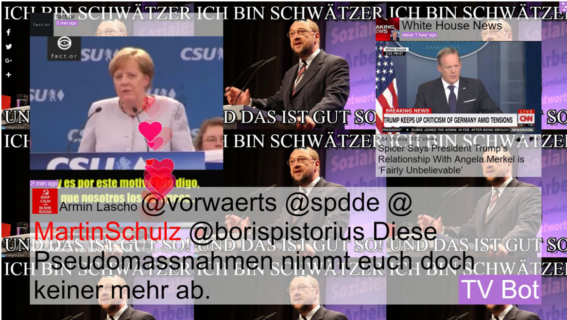
Bundestagswahl - Meinungskampf in den Sozialen Medien, 2017

A The development is both a blessing and a curse. As humans we are becoming more and more transparent while at the same time participating in an incredible amount of knowledge and information. For example, every day more than 80 million images are posted on Instagram alone. I use this material for many of my works. In traditional photo and video art art, it used to be artists or artist collectives who decided on what we would come to know. Usergenerated content lets people from all over the world tell stories and have a voice. In this way, our lives, our hopes and wishes as well as our cultures can be reflected globally. Maybe even more successfully so than with traditional art. Besides, I love the fleetingness and transience of these pictures. Every few minutes millions of new images are created and this is a process that is symbolic of the nature of all things.