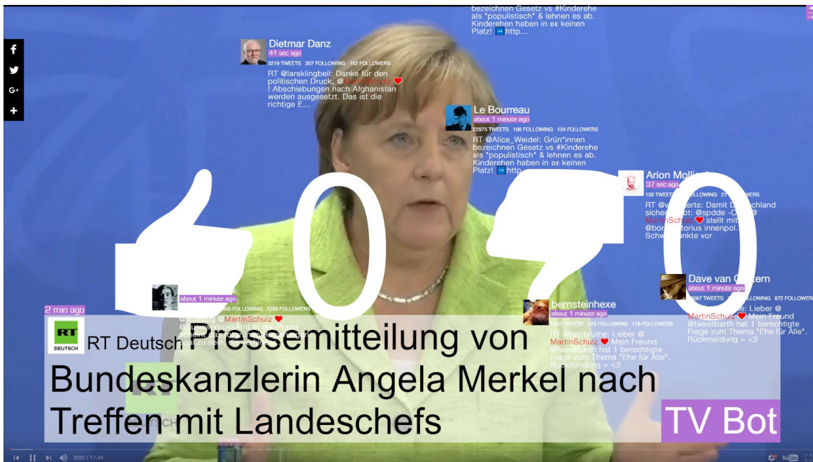
Bundestagswahl - Meinungskampf in den Sozialen Medien, 2017, Screenshot © Marc Lee

A look beyond the borders of your own echochambers and filter bubbles, presented from 9 September as an installation in the exhibition No Image Is an Island at Port25 – Raum für Gegenwartskunst, Mannheim, and at the Thalia bookstore at Paradeplatz in Mannheim's city centre.